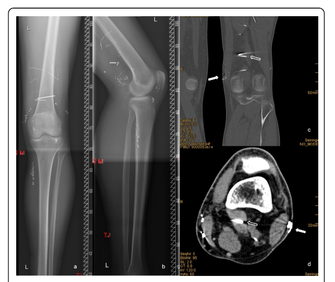
Figure 1 a-d. a&b) Preoperative anteroposterior and lateral radiographs of the left femur and tibia showing multiple radiopaque particles, spikes and spicules in the soft tissues around the knee. c&d) Coronal and transversal CT scan of the left knee and the affected soft tissues showing several metallic foreign bodies (hollow arrow: 2 spikes) and mercury depots (white arrow).

Blood was taken to determine mercury concentration, the C-reactive protein (CRP) and renal function parameters preoperatively. While the renal parameters revealed no pathologic findings, the blood level of mercury (6,80 \mu g/dl) was 17-fold higher than recommended by the reference laboratory (standard: 0-0,40 \mu g/dl; Figure 2). The CRP was increased, additionally. Surprisingly,