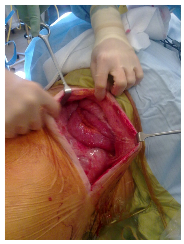
Figure 3 Intra-operative view of lumbar hernia, through previous latissimus dorsi scar.

adhesions and the small bowel and caecum reduced into the intra-abdominal cavity. The edges of the defect were closed with interrupted PDS, and a 30\times30 cm onlay prolene mesh was used for reinforcement.