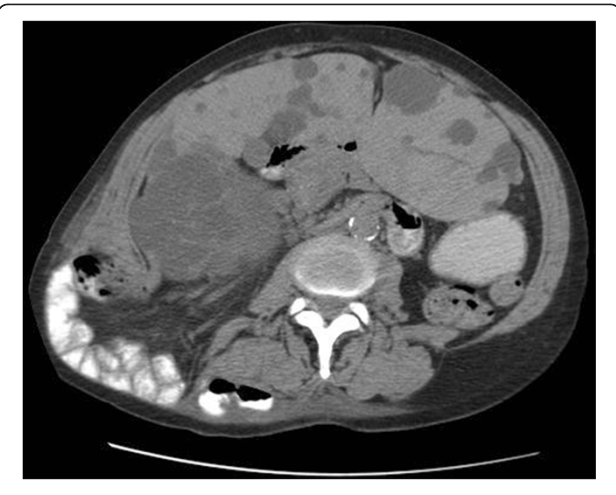
Figure 1 Axial CT scan demonstrating incisional lumbar hernia.

lump, clinically in keeping with a possible lumbar hernia. An urgent CT scan of the abdomen and pelvis confirmed the diagnosis of a lumbar hernia containing the majority of the small bowel and right colon (Figures 1 and 2). The CT scan also demonstrated an incidental finding of an enlarged polycystic liver.