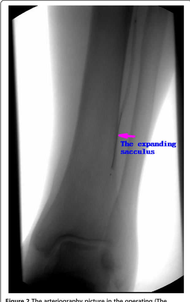
Figure 2 The arteriography picture in the operating (The sacculus was expanding the anterior tibial artery).

In the observation group, ten days after the treatment, level 1 patients under the Wagner classification