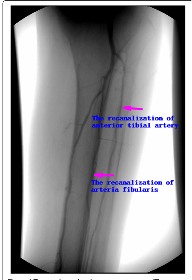
Figure 4 The arteriography picture post treatment (The recanalization of anterior tibial artery and arteria fibularis).

In the world, due to changes in the structure of people's diet, the incidence of diabetes has increased gradually and so has incidences of lower extremity disability caused by diabetic peripheral arterial disease. The Framingham study showed that there was a 3.5- and 8.6-fold excess risk