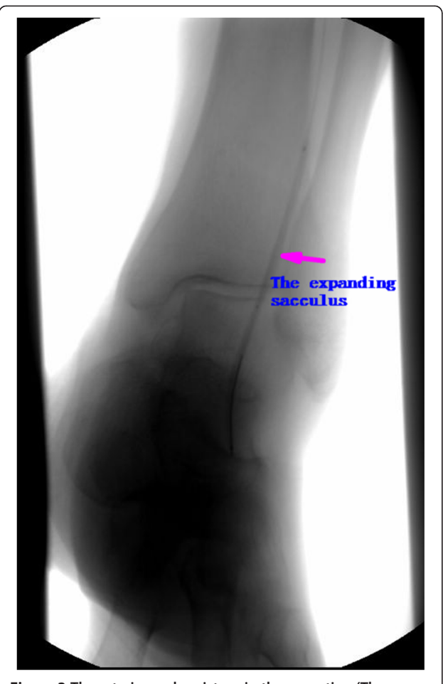
Figure 3 The arteriography picture in the operating (The sacculus was expanding the arteria fibularis).