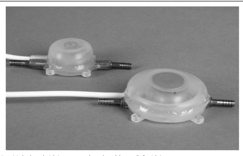
Figure 3 Valve after revision (right hand side) compared to the old one (left side).

The study is of descriptive nature. The results reflect the experiences with this new artificial bowel sphincter device. The data were collected uniformly and prospectively. Although the results are compared with published data for the well-studied Neosphincter, general statements can not be made about an advantage or inferiority of the AAS.