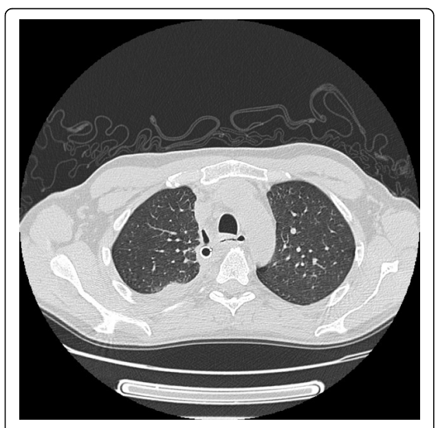
Figure 2 CT scan demonstrated the resolution of infections . It is well evident the chest drain within mediastinum on the right side that allowed the drainage of infection.

The most dreaded and probably lethal form of mediastinitis is the diffuse necrotizing variety that occurs as a