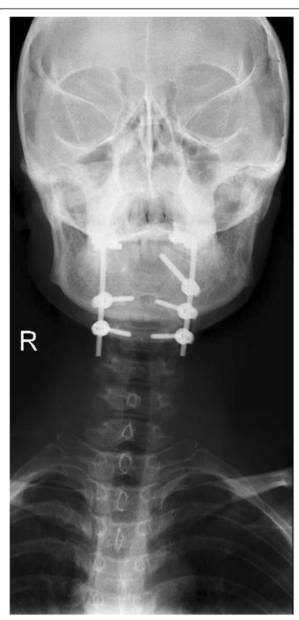
Figure 3 Anteroposterior X-ray postoperative image.

Occipitocervical fusion is a very effective method for reconstruction of upper cervical instability caused by tumor. Many fusion methods have been developed, such as conventional occipitocervical fusion, which adopts simple bone grafting for fusion. Foerster firstly proposed the occipitocervical fusion with free vascularized fibular grafting in 1927 [4]. After then, many different kinds of posterior occipitocervical fusion and fixation techniques have been reported. Occipitocervical bone grafting with