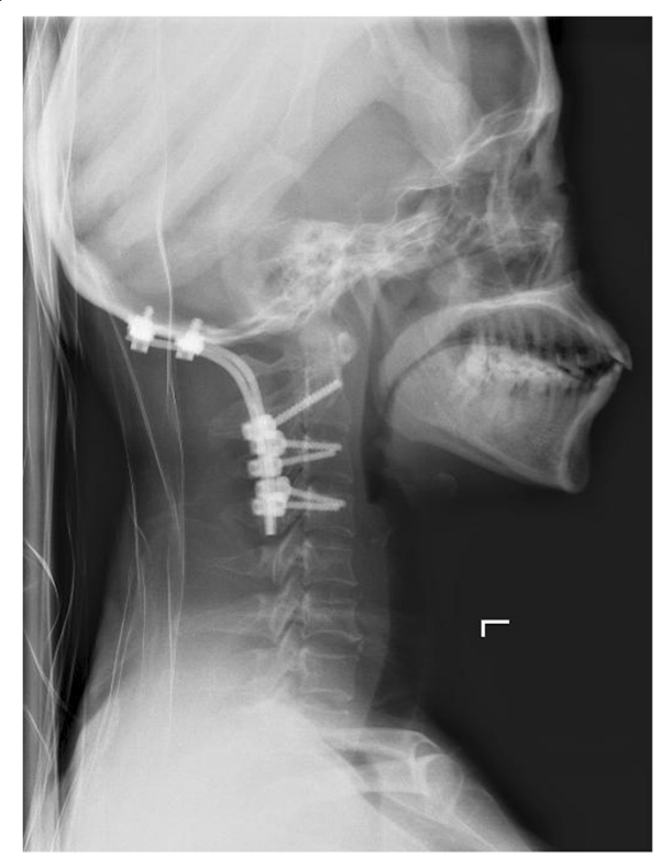
Figure 4 Lateral X-ray postoperative image.

additional sublaminar wiring may be more stable than single bone grafting. However, the patient still need bed rest for 12 weeks. Spinal cord injury and rotational instability often occurred in those patients [5]. Ransford described a novel technique in 1986. An anatomically contoured steel loop was secured to the occiput via small burr holes and to the vertebrae by sublaminar wiring. It afforded a rigid stabilization. The patient could mobilise with a cervical collar or cervicodorsal brace only [6]. In early 1990s, occipitocervical plate had been applied, and then screw-rod system. In 2000, universal vertebral pedicle screw has been widely used. The posterior occipitocervical fixation could provide more stable fixation, which is relatively easier to perform and less risky [7,8].