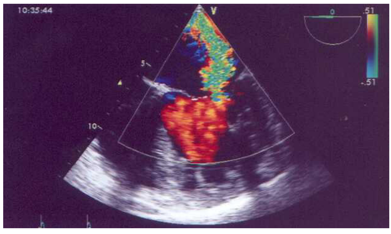
Figure I Severe mitral regurgitation.

mur since the age of 15 years. Physical examination revealed a regular pulse of 72 beats per minute, blood pressure of 120/70 mm Hg and a pansystolic murmur at the apex. There were no clinical signs of left or right heart failure.